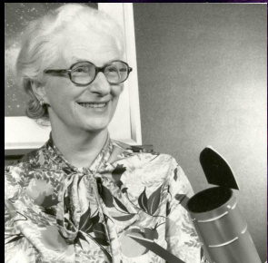
Nancy Grace Roman