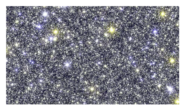
Probing stellar populations of the Milky Way: Simulated Roman image of a Milky Way bulge field covering 1/140th of Roman's field of view in three filters: F087, W146, F184. (M. Penny 2019, ApJS, 241, 3).

The Roman Space Telescope's unique combination of Hubble-like resolution, near-infrared sensitivity, and wide field of view will provide key insights into star formation processes in the Milky Way bulge, bar, and disk. Roman will provide: