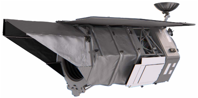
NASA's Nancy Grace Roman Space Telescope