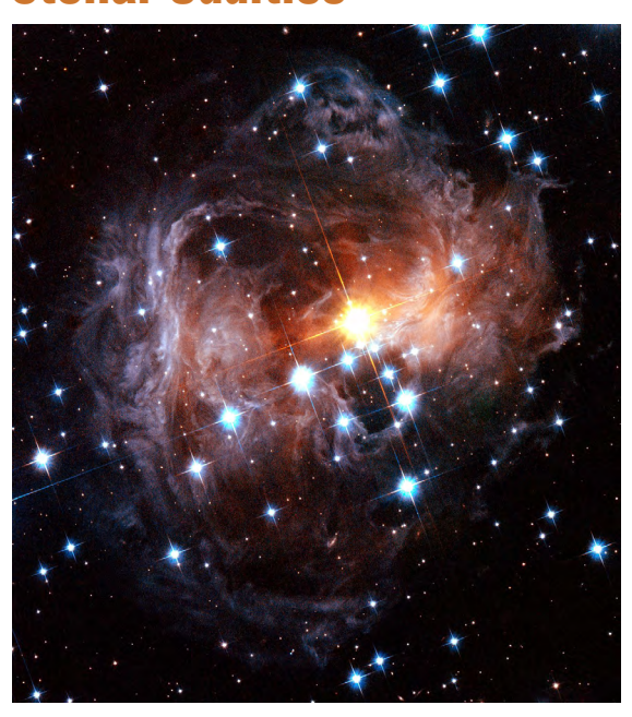
Capturing transient phenomena: Infrared Hubble image of variable star V838 Mon and its light echo: HST ACS/WFC, F606W (V) and F814W (I).

Roman is capable of detecting and characterizing transient events and variable phenomena with milli-magnitude changes on time scales of minutes to years. Roman will provide: